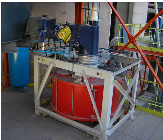
Kiln feed installation at a clinker production line in Romania.

A feed bin on load cells provides raw meal to Pfister FRW rotor weighfeeder. The flow control gate ensures a pre-feeding into the rotor weighfeeder which then is providing an accurate and stable dosing of raw meal into the preheater at a rate of up to 380 tph.