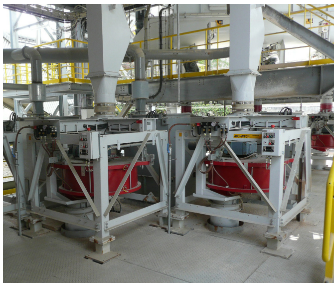
Pfister® FRW blending installation at the finish mill of a cement plant in Germany.

Kiln dust with high chlorine content and fly ash are precisely dosed into the cement mill. Reproduceable weighing date ensures that the cement quality is maintained while adding blending materials to the cement mix and the final product's carbon footprint.